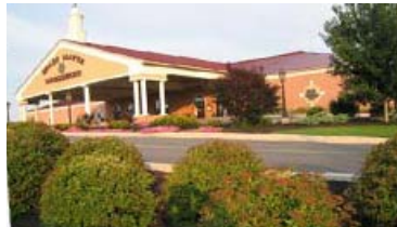
Shady Maple Restaurant